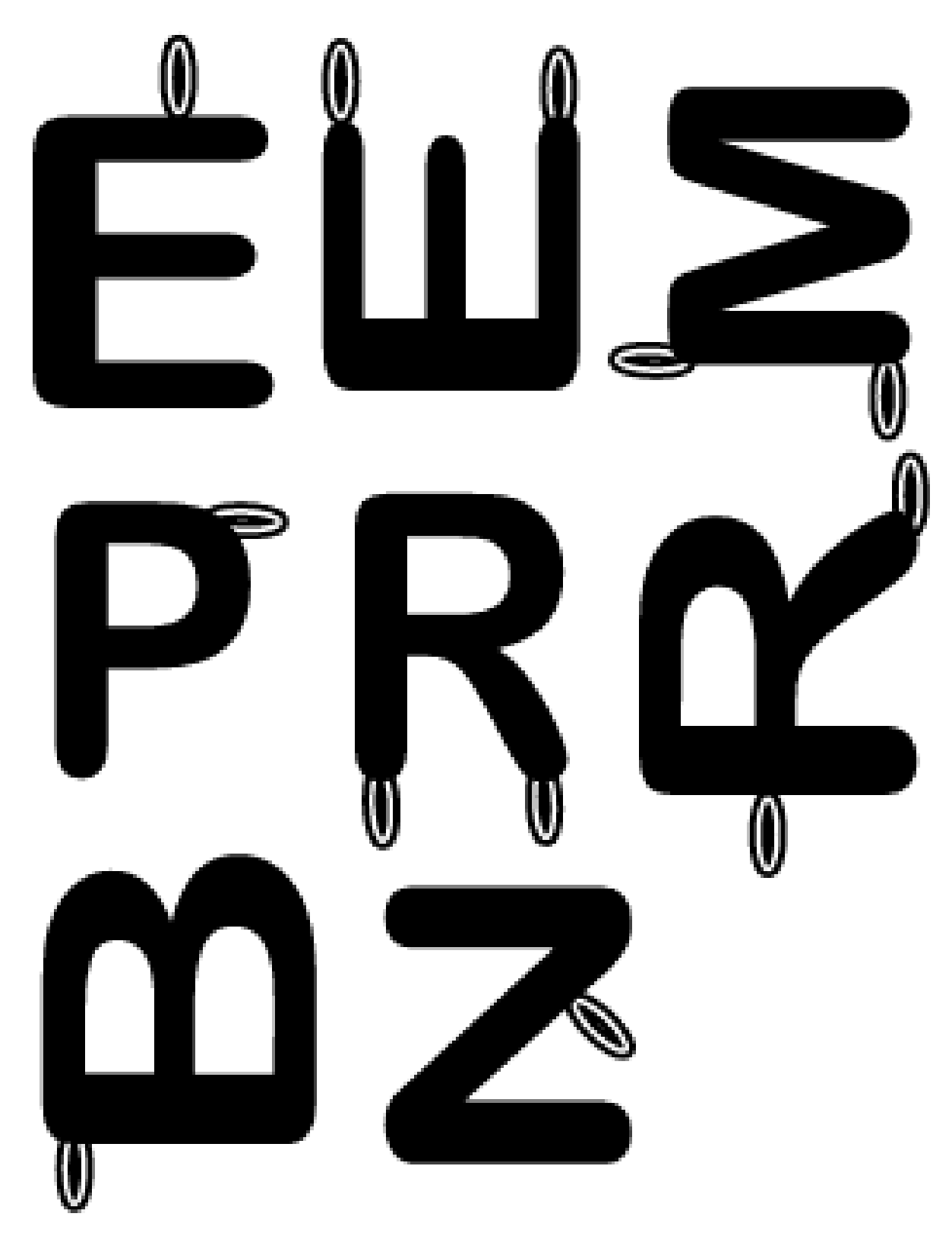
Sheet 2 - Practice Sheet